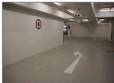
•Heavy Duty Anti-Skid Epoxy Floor Coating