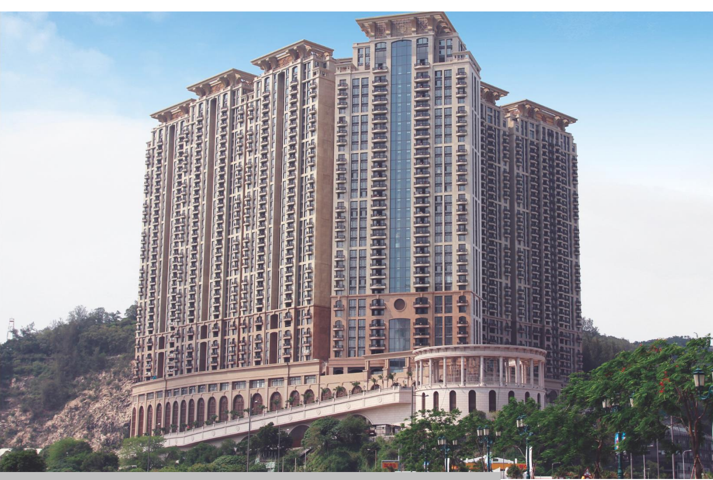
Tai Tam Shan Residential Development