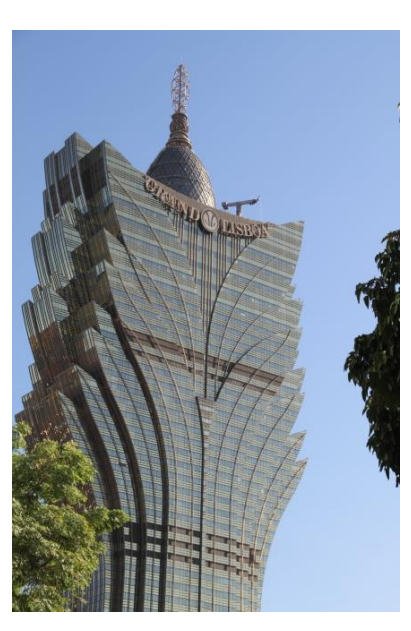
• New Lisboa, Macau