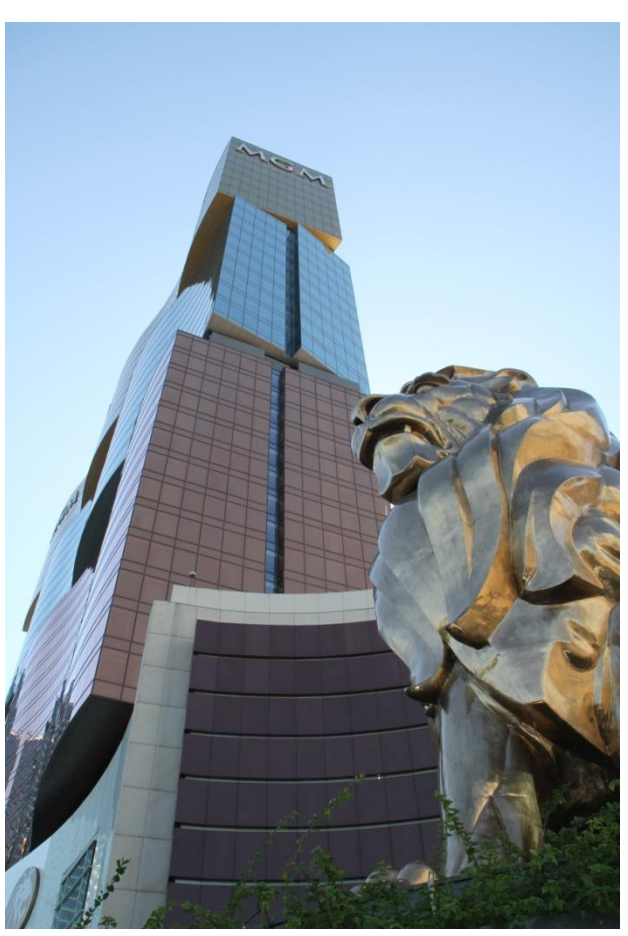
• MGM, Macau