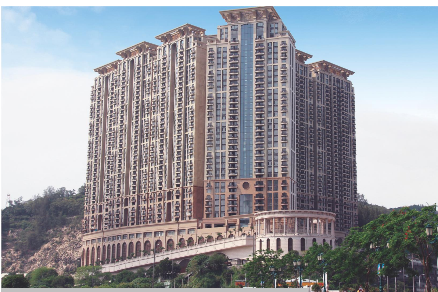
Tai Tam Shan Residential Development