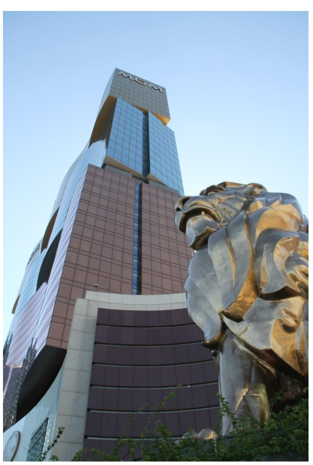
• MGM, Macau