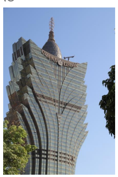
• New Lisboa, Macau